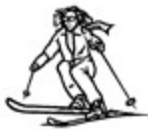
SNOW SKIER 2