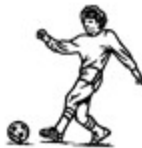
SOCCER PLAYER 2