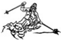
SNOW SKIER 1